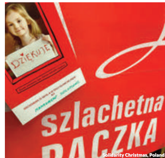
Solidarity Christmas, Poland