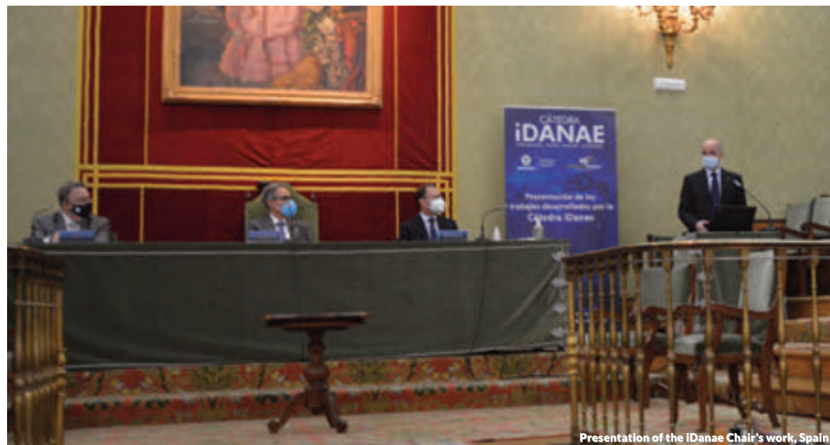
Presentation of the iDanae Chair's work, Spain

Lastly, the 4Q20 publication is focused on causality in the field of Machine Learning models, and its impact on the development of these models, deepening into the importance of the application of causality knowledge to artificial intelligence to achieve models with an improved capacity for generalization, so that spurious and biased relationships are ruled out.