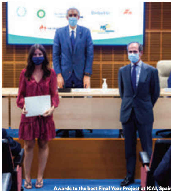
Awards to the best Final Year Project at ICAI, Spain