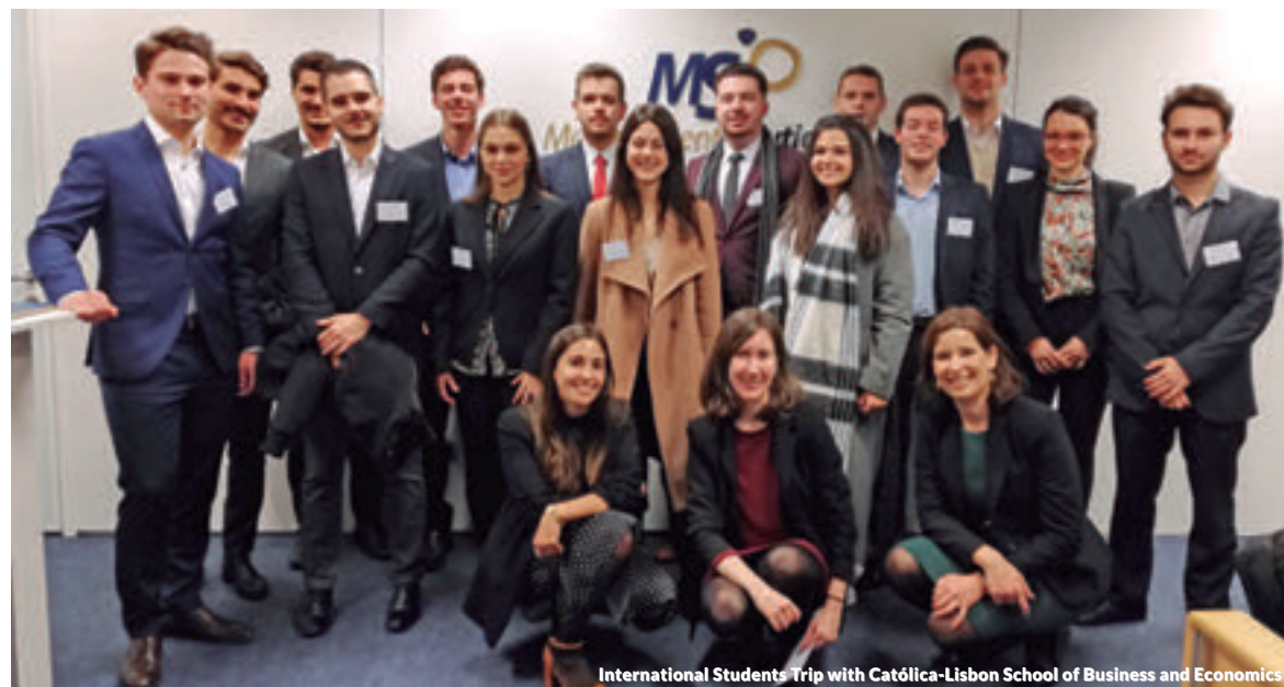
International Students Trip with Católica-Lisbon School of Business and Economics