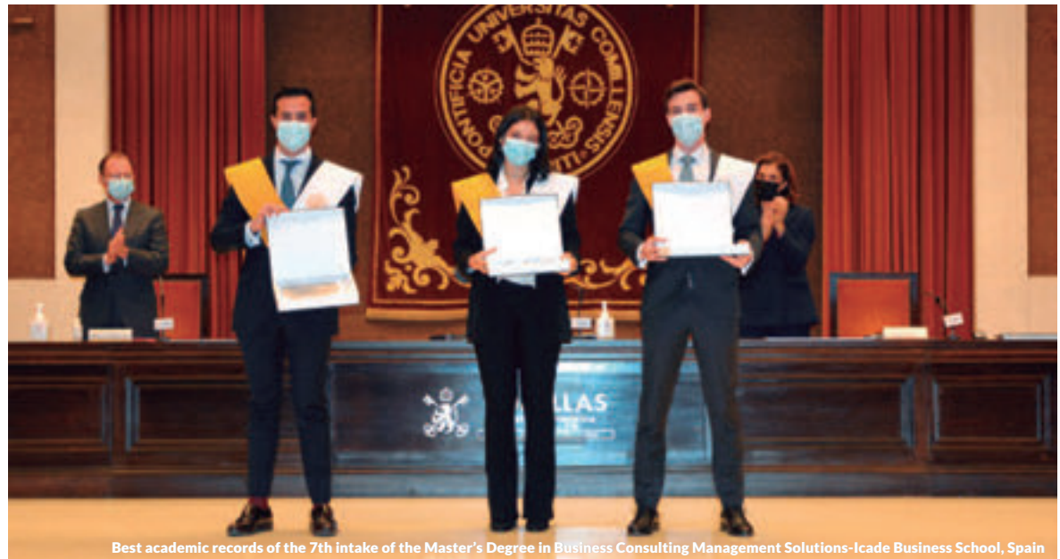
Best academic records of the 7th intake of the Master's Degree in Business Consulting Management Solutions-Icade Business School, Spain

Also, since 2019 Management Solutions teaches a training program for senior professionals in the Brazilian office in partnership with the Insper Institute, one of the most prestigious higher education institutions in Latin America, offering commercial management and marketing content applied to financial services, digital transformation and problem solving.