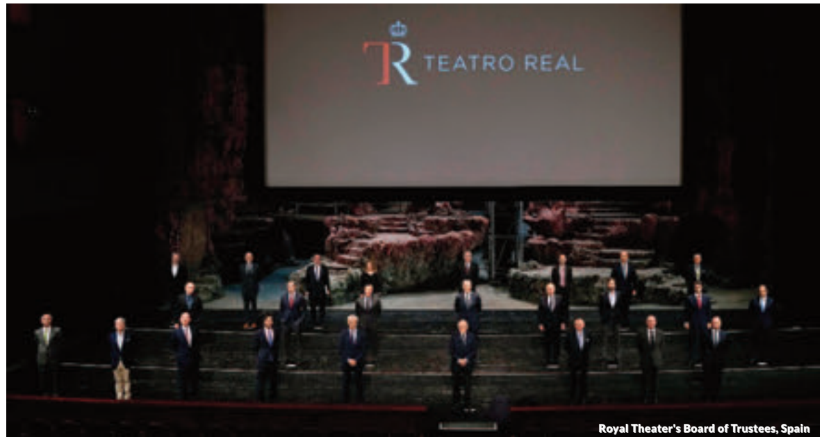
Royal Theater's Board of Trustees, Spain

Additionally, Management Solutions has collaborated with the Friends of the Royal Theatre Foundation for the fourth consecutive year. The foundation is established to support, promote and develop the Royal Theater's cultural activities and projects.