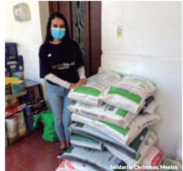
Solidarity Christmas, Mexico

The campaign "Double your help against COVID-19", which became global after its success in Brazil, had the involvement of more than 150 professionals from across all Management Solutions offices. The sum of donations from all countries reached € 10,000, which, after the contribution made by Management Solutions, became € 20,000 to purchase food to