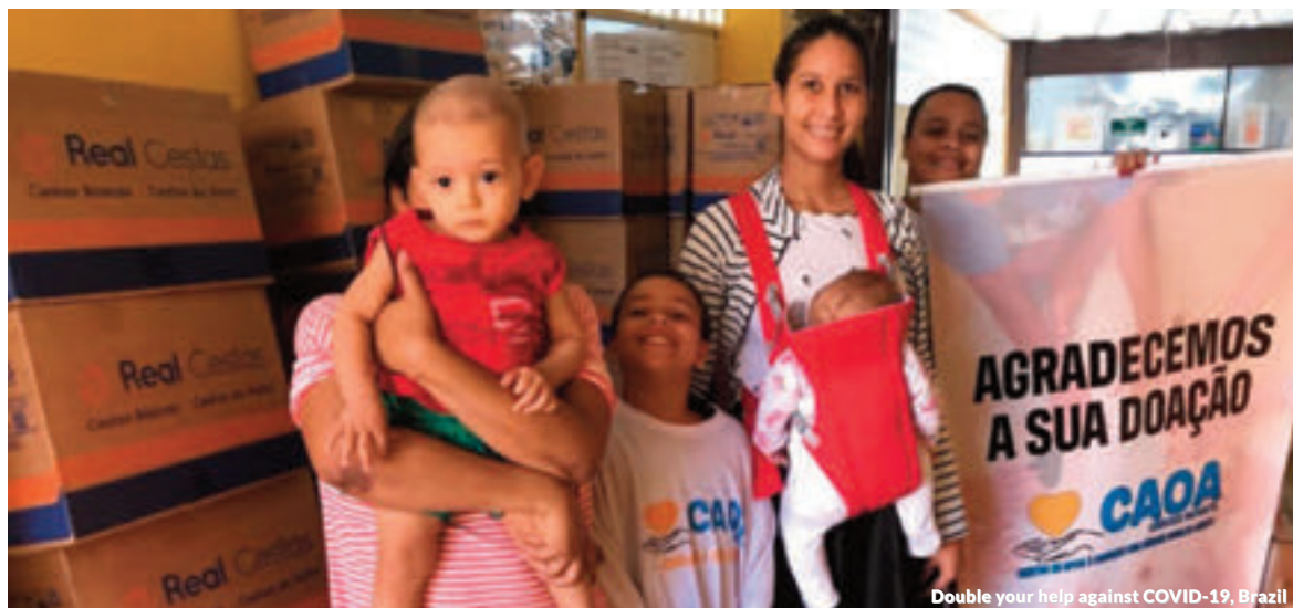
Double your help against COVID-19, Brazil