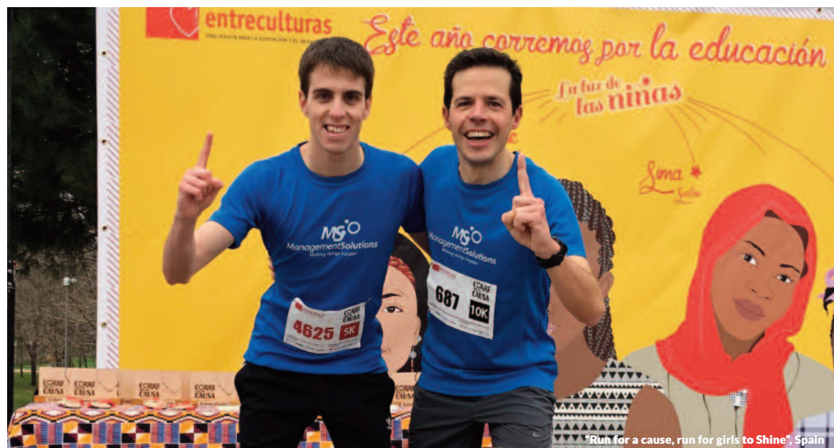
Run for a cause, run for girls to Shine, Spain

Management Solutions is aware that women are a fundamental pillar of the Firm's activity as well as of society, and equal opportunities – with no discrimination at all – is one of its basic principles. For this reason, the Firm joined the initiative in