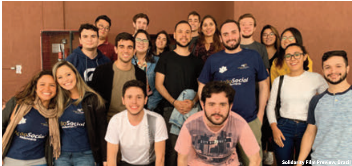
Solidarity Film Preview, Brazil

Children's Home to spend an afternoon full of joy at the cinema, which the little ones enjoyed with popcorn and soft drinks.