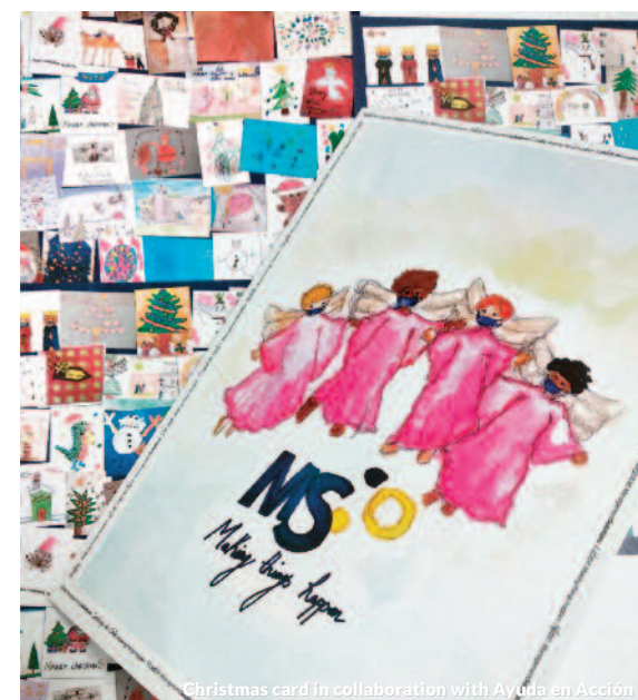
Christmas card in collaboration with Ayuda en Acción