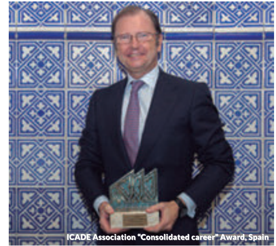
ICADE Association "Consolidated career" Award, Spain